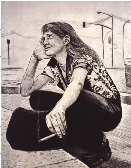
Smoking, from Leading Causes of Death in America , direct gravure etching 30 x 22 inches