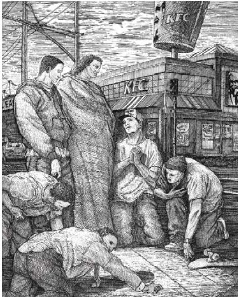
Canto XIV: Guido and Rinier, from Purgatorio.